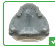
Full palate, no holes