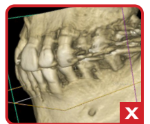
Bite is closed